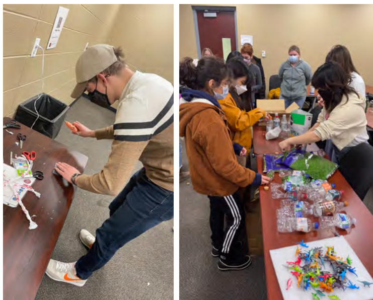
Students turned plastic bags into coasters, bins, and organizers in one events, and jars into terrariums in another.

In February, Lewis Sustainability hosted Upcycle Month with numerous themed events and social media challenges. The first event was a virtual information session that taught participants the basics of upcycling, particularly what separates it from recycling and downcycling. The next events were in-person events that allowed participants to practice upcycling. The first event was DIY Upcycle Terrariums in which jars were turned into microecosystems for moss. The next event was an Upcycle Plastic Bag event in which participants learned how to give plastic grocery sacs a new life. Plastic bags were turned into coasters, pencil holders, organizers, waste bins, and more. These events together gave participants a way to learn about upcycling, in addition to learning how to put it into practice themselves.