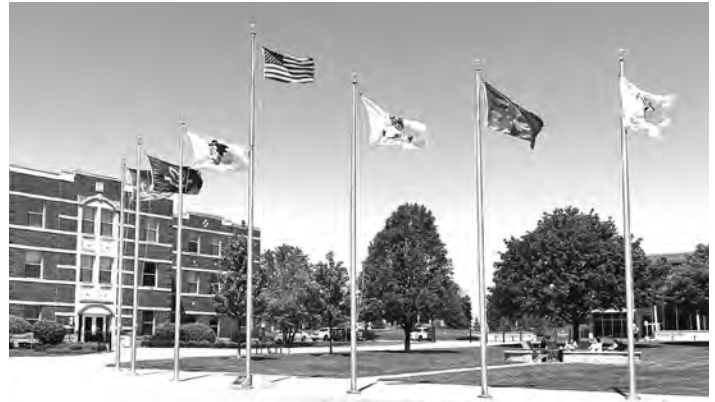
Veterans Memorial Flag Plaza

O say can you see by the dawn's early light, What so proudly we hailed at the twilight's last gleaming? Whose broad stripes and bright stars through the perilous fight, O'er the ramparts we watched, were so gallantly streaming! And the rockets' red glare, the bombs bursting in air, Gave proof through the night that our flag was still there. O say does that star-spangled banner yet wave, O'er the land of the free and the home of the brave?