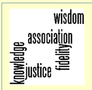
Values behind the Lewis mission

These documents are available on Blackboard too.